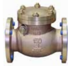
ALUM. BRONZE TRIM ITEM ID: 052503