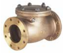
MONEL TRIM ITEM ID: 052504